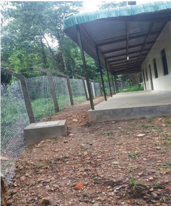
Bwindi Community Hospital Security Fence