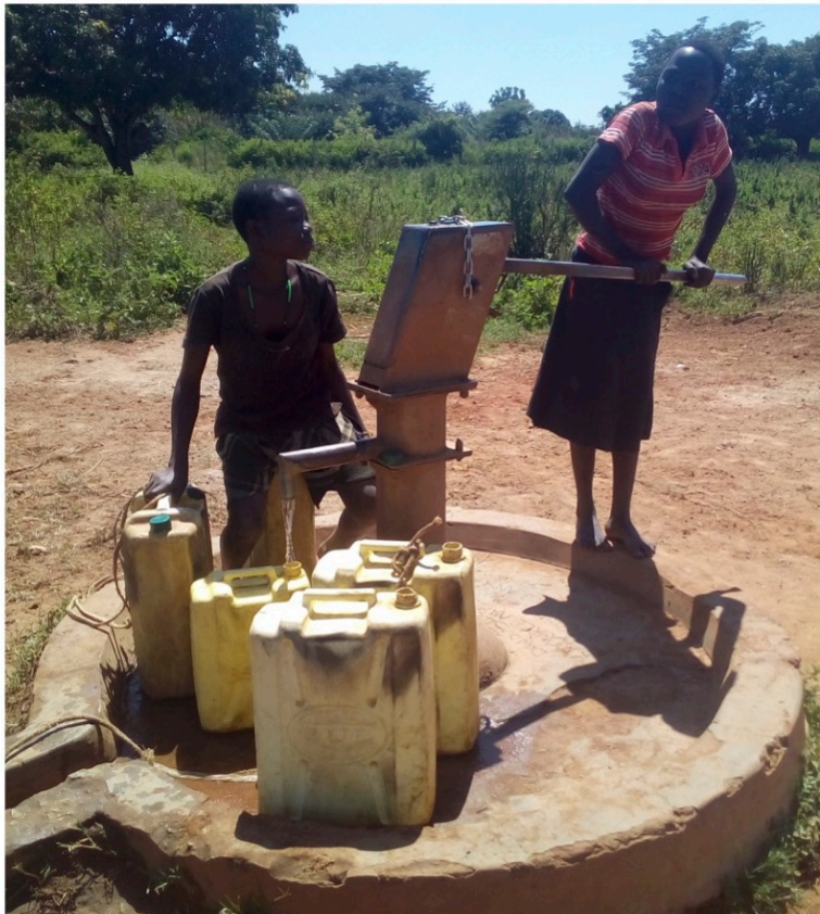
Bore Hole - Mukono District, Uganda