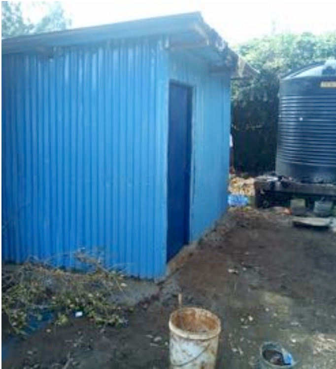
Kenya Helps/Global Hope Rescue Food Shed