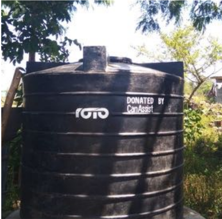
Kanyala Little Stars School Water Catchment Tank