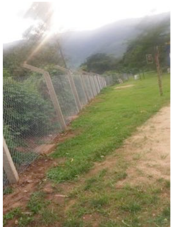
Biwindi Community Hospital, Uganda Fencing