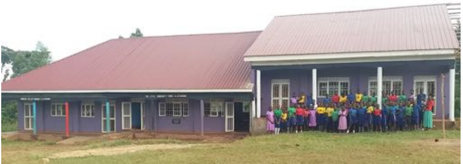
Hope for Youth School, Uganda Classrooms