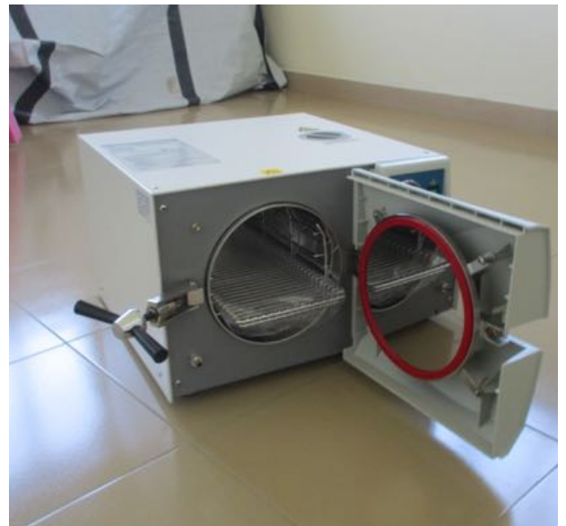
Holy Innocent Medical Clinic, Uganda Medical Equipment