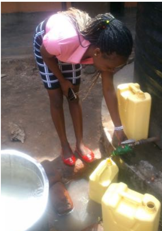
Mukono Business Skills Institute, Uganda Water Tank