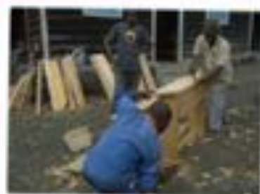
CARPENTERS CONSTRUCT DESKS FOR THE SCHOOL. THE PROJECT PROVIDED WORK FOR LOCALS.

A heads up - two CanAssist donors will team up to match donations to CanAssist in conjunction with Giving Tuesday. Stay tuned and double the bang for your buck.