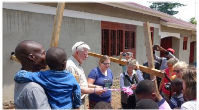
CanAssist visitors cut the ribbon on the new teachers' house at the Hope for Youth School in Uganda. 13/02/16