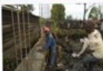
WORKMEN BUILDING A SOLID STONE FENCE AROUND THE TCHUKUDU PROPERTY IN DEMOCRATIC REPUBLIC OF CONGO