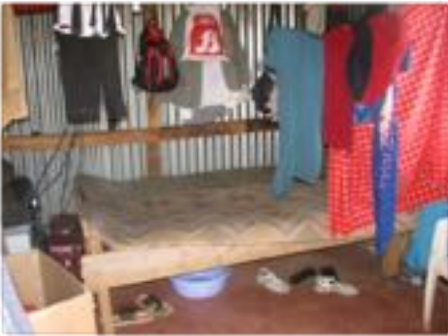
This room was home to four teachers at the Nkuyan School before CanAssist funded construction of a new teachers' house.