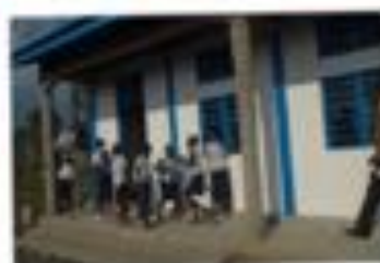
THE HOLIDAY SCHOOL PROVIDES AN OPPORTUNITY FOR EDUCATION WHERE NONE EXISTED BEFORE.