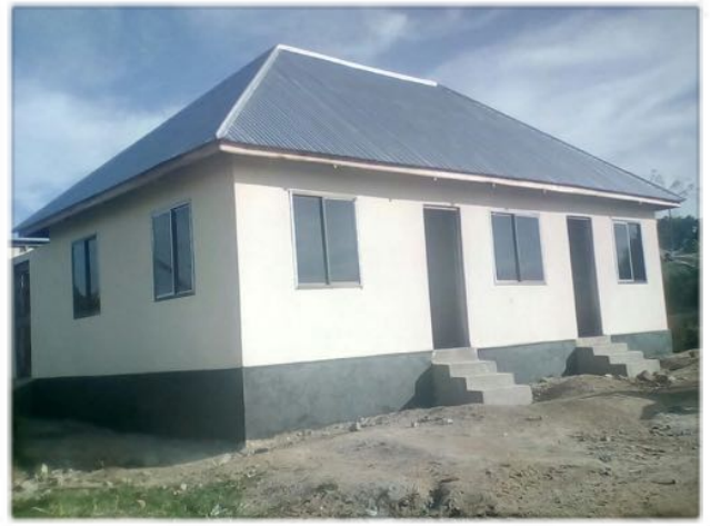
The CanAssist teachers' accommodation at Kabuhinzi School, completed in December 2016.