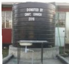
WATER CATCHMENT SYSTEM AND HAND-WASHING STATION AT THE HOPE SCHOOL, MBITA, KENYA