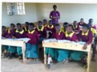
STUDENTS IN THE CANASSIST CLASSROOM AT THE ADAM NKUYAN SCHOOL - AUG 2016.

Our heartfelt thanks for your ongoing generous support.