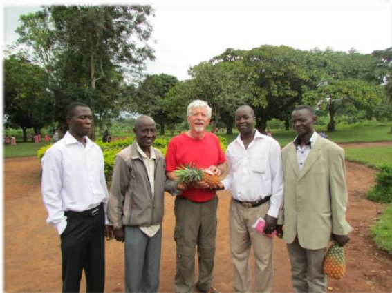
Teachers at the Kyabazaala Elementary School in Uganda welcome a CanAssist visitor with the gift of a fresh local pineapple.