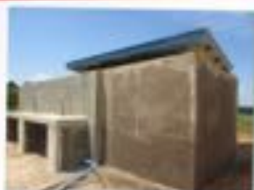
THE NEW LATRINE AND HAND WASHING STATION AT KABUHINZI SCHOOL ON UKEREWE ISLAND.

CanAssist has been delighted to partner with these friends and their donors to help support African communities.