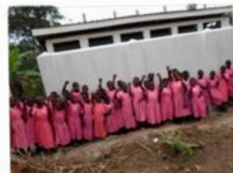
CANASSIST-FUNDED GIRLS LATRINE AT THE KAYENJE ELEMENTARY SCHOOL IN RURAL UGANDA.