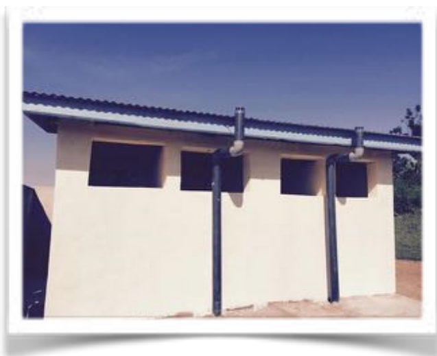
Latrine constructed at the Kabuhinzi school with CanAssist funds in early 2016.

In an effort to attract and maintain qualified teachers, the schools try to offer accommodation to their teachers who come from other districts. Sometimes having some sort of teachers' housing is demanded by the Ministry of Education but the government provides no financial support to the school to achieve this. The buildings may be simple iron-walled structures; some are stone block buildings with