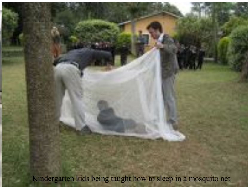
Kindergarten kids being taught how to sleep in a mosquito net