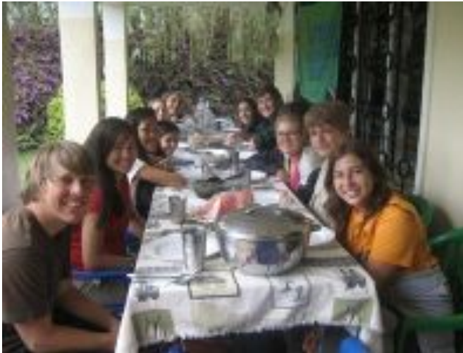
The American students having their lunch

On 19th and 20th we welcomed different groups of students from America who came for a whole day cultural tour( shown how to make coffee and went to the waterfalls) and after, played with students in school.