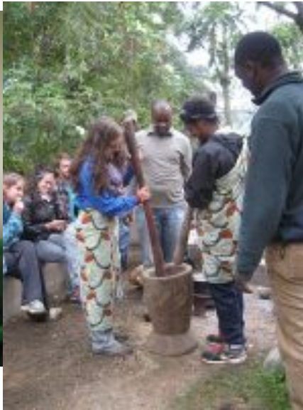
The American students making the coffee